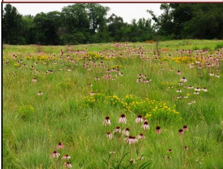
Native plants Eddyville Dunes Sand Prairie